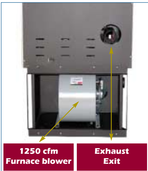
1250 cfm Furnace blower