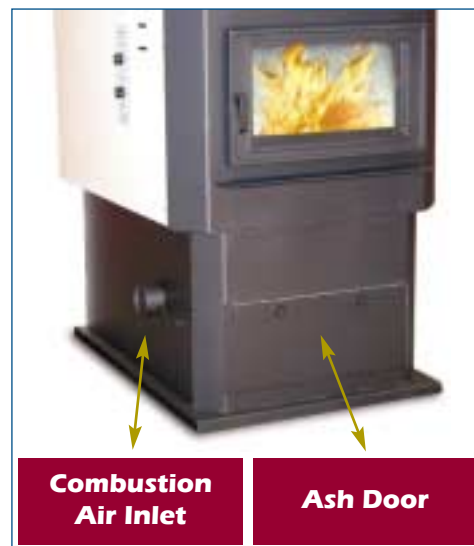
Combustion Air Inlet